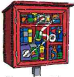
Free Little Pantry