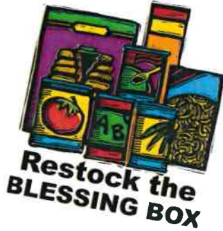
Restock the BLESSING BOX

Our Blessing Box could use a re-stock! Here are items you could focus on collecting: